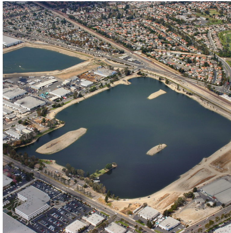
Orange County Water District provides sustainable water for 2.5 million residents of Orange County since 1933.

The long history and evolution of IPR requirements for the control of pathogens and chemicals, and the role of source control and monitoring, treatment, operations, staffing, and governance all informed the DPR requirements.