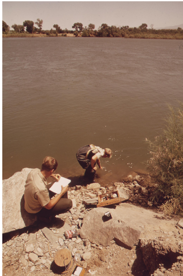
California fish and game biologists take water samples from the Colorado River, 1972.

Another major change that occurred between 1974 and 2014 was how the industry thought about controlling pathogens. It may be surprising, but the proverbial 12/10/10-log reduction of virus/ Giardia / Cryptosporidium requirement that is synonymous with California potable reuse and widespread throughout the potable reuse world today did not make its first appearance until 2011. In 1974, water was determined to be microbially acceptable if minimum levels of treatment were provided and the concentration of coliform bacteria was maintained at low levels. At the same time, scientific research was demonstrating that water with non-detect levels of coliforms could still result in infection and disease associated with non-bacterial pathogens (i.e., virus and protozoa). The nascent field of quantitative microbial risk assessment was also providing new approaches for estimating the relationship between treatment and risk. The shift from the coliform standard to risk-based treatment occurred in the United States with the Environmental Protection Agency's (EPA's) adoption of the Surface Water Treatment Rule in 1989. Even though these scientific and regulatory advancements occurred outside of potable reuse proper, their imprint on the development of 12/10/10 is clear. The original GWR regulations were able to adapt to these fundamental shifts in public health protection and protect against the emerging pathogens of the time.